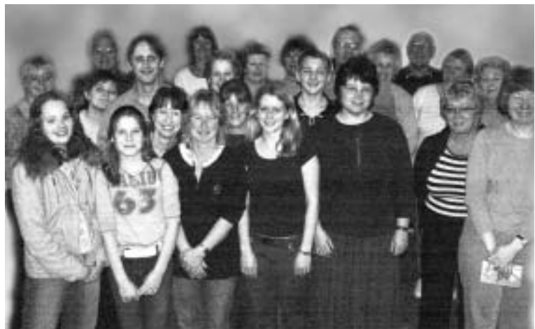
Looking ready for the "Bon Voyage" are the passengers and some of the crew